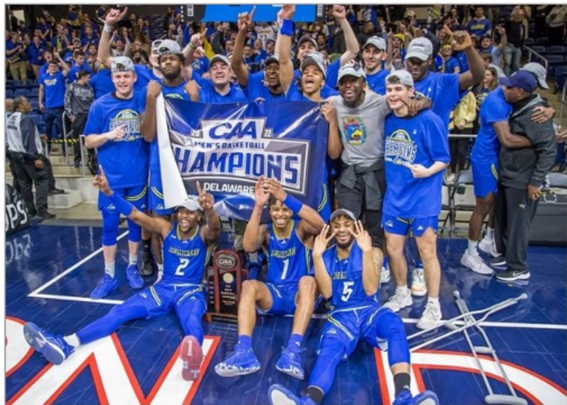
Men's Basketball vs. Villanova 2:45 p.m. Friday, Pittsburgh, Pa. (on CBS)