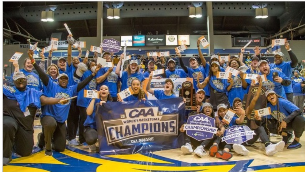
Women's Basketball vs. Maryland 5 p.m. Friday, College Park, Md. (on ESPNU)