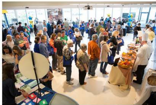
STAR Health hosts the annual Nutritious Newark Cook Off in partnership with local restaurants. The chefs in each restaurant team with a UDCHS dietician to compete to create a dish that community votes on to win "Best Presentation", "Most Creative" and Tastiest Dish in Newark".