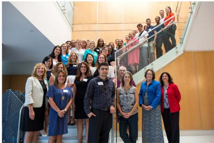
The new faculty and staff reception in the fall of 2017 showcased all the new hires that touch research, education and care throughout all departments of UDCHS.