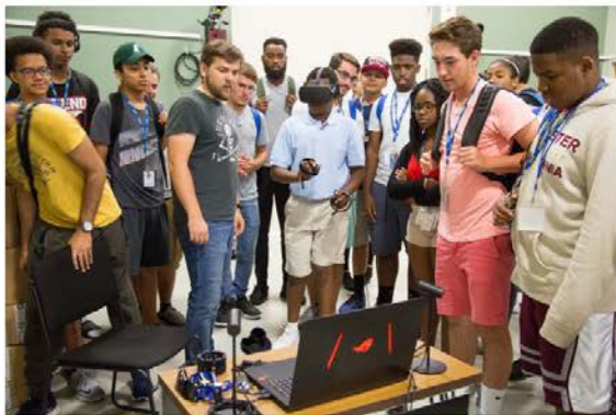
The Inaugural Health Sciences Summer kicked off during the summer of 2017. Low-income and minority students from high schools in all three counties throughout Delaware participated in the week-long, on-campus camp to see everything UDCHS has offer.