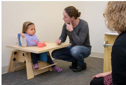
The Speech Language and Hearing Clinic treats children to older adults