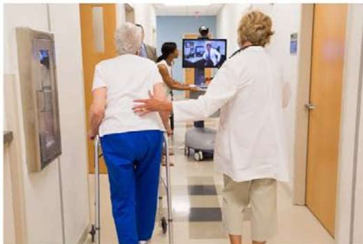
Telemedicine is used for the Parkinson's Clinic at the Nurse Managed Primary Care Center