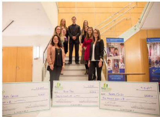
First Step teams participate in a year-long program to solve societal, environmental and health grand challenges. These interdisciplinary teams compete for money to turn their ideas into a reality.