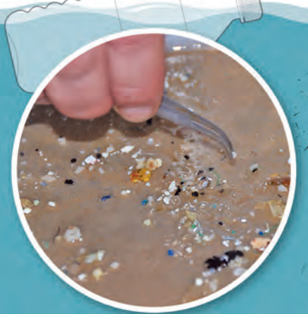
▲ Microplastics collected from Delaware Bay