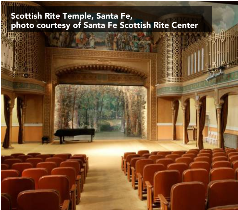
Scottish Rite Temple, Santa Fe