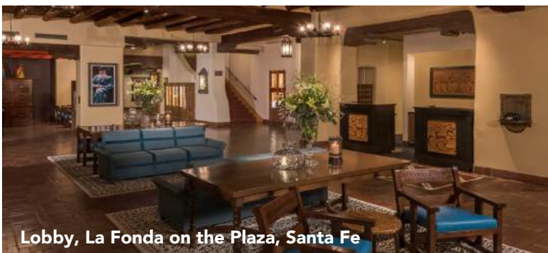
Lobby, La Fonda on the Plaza, Santa Fe