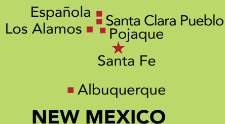
Map of the region