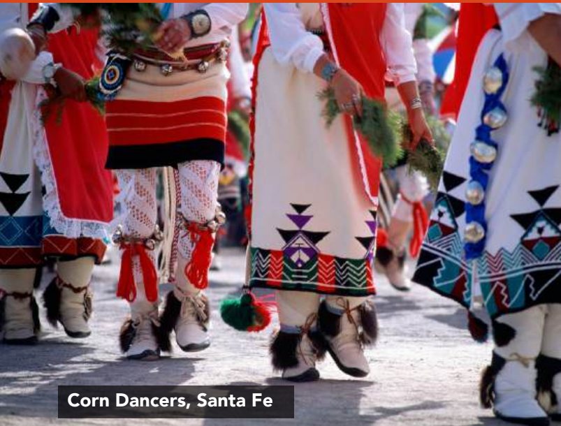
Corn Dancers, Santa Fe