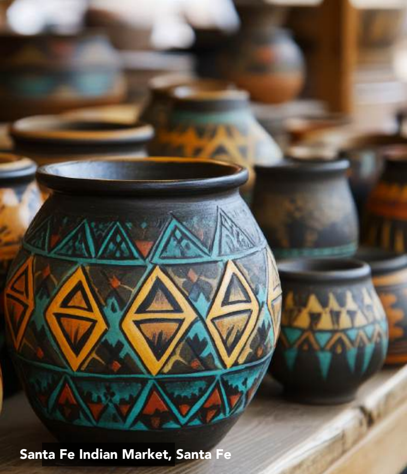
Santa Fe Indian Market, Santa Fe