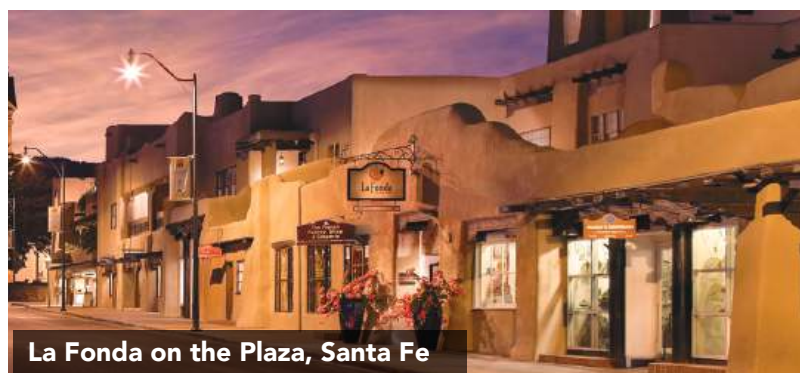
La Fonda on the Plaza, Santa Fe

Built in 1922 on the site of Santa Fe's first inn dating to the 1600s, this hotel has welcomed artists, political leaders, and Hollywood stars seeking inspiration in the New Mexico capital. From the hand-painted glass panes to the vigabeamed ceilings, every detail in this adobe landmark represents the craftsmanship of local artisans.