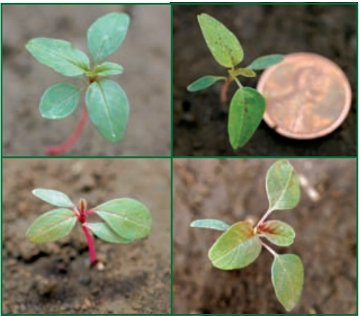
Figure 1. ( Clockwise from top left ) Seedlings of waterhemp, Palmer amaranth, redroot pigweed, and smooth pigweed.