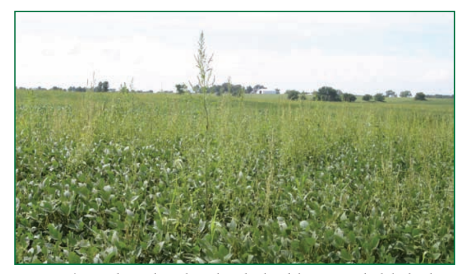
Figure 5. The waterhemp plants shown here developed three-way multiple herbicide resistance — to glyphosate, ALS-, and PPO-inhibitors.

Waterhemp was among the first U.S. weeds identified with multiple herbicide resistance. In 1998, a waterhemp population was confirmed resistant to ALS- and PSII-inhibiting herbicides (atrazine, etc.). More recently, waterhemp garnered the distinction of being the first U.S. weed to develop three-way multiple resistance — these combinations include resistance to ALS-, PSII-, and PPO-inhibiting herbicides; and glyphosate, ALS-, and PPO-inhibiting herbicides (Figure 5).