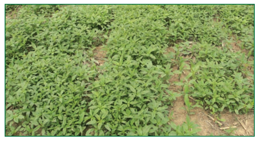
Figure 4. Waterhemp gains a competitive advantage over other plants because of high densities.

Although several summer annual weeds are more competitive on a plantfor-plant basis, waterhemp gains a competitive advantage through the sheer number of plants infesting an area (Figure 4). Seasonlong competition by waterhemp (more than 20 plants per square foot) reduced soybean yields 44% in 30-inch rows and 37% in 7.5-inch rows (Steckel and Sprague, 2004b). Waterhemp that emerged as late as the V5 soybean growth stage reduced yields up to 10%.