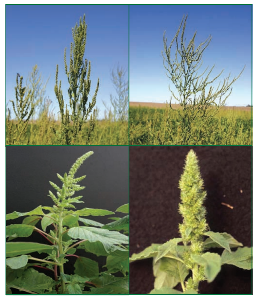
Figure 2. ( Clockwise from top left ) The seedheads of male waterhemp, female waterhemp, redroot pigweed, and smooth pigweed.

Palmer amaranth also is dioecious; whereas redroot and smooth pigweeds are monoecious (that is, the same plant has male and female flowers). Redroot and smooth pigweeds have denser, more compact seedheads than waterhemp, and Palmer amaranth has long, mostly unbranched, prickly seedheads (Figure 2).