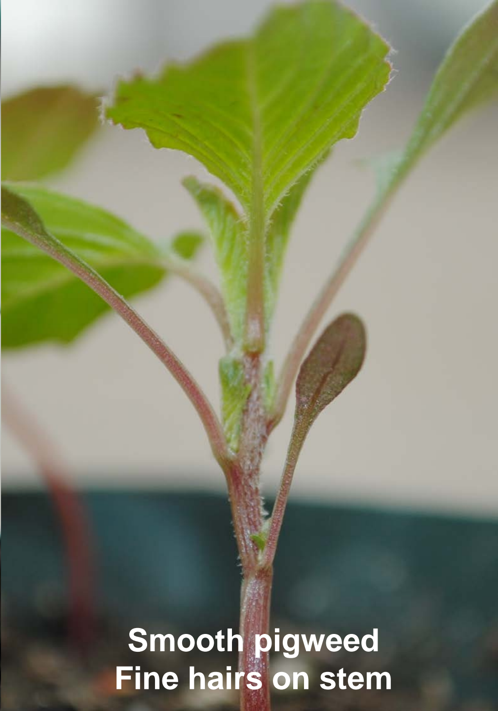
Smooth pigweed Fine hairs on stem