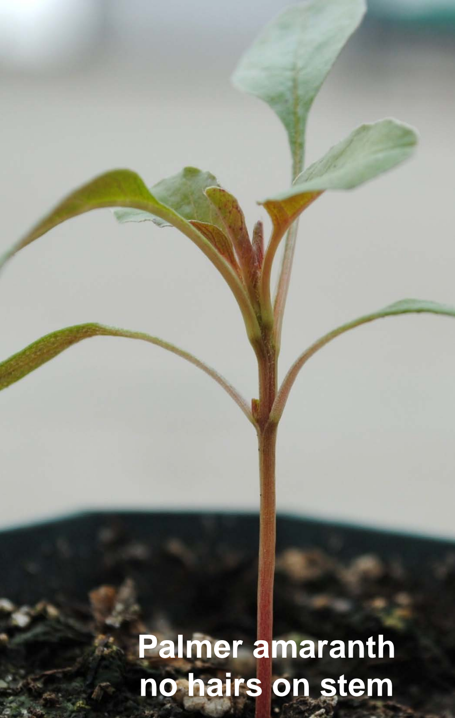
Palmer amaranth no hairs on stem