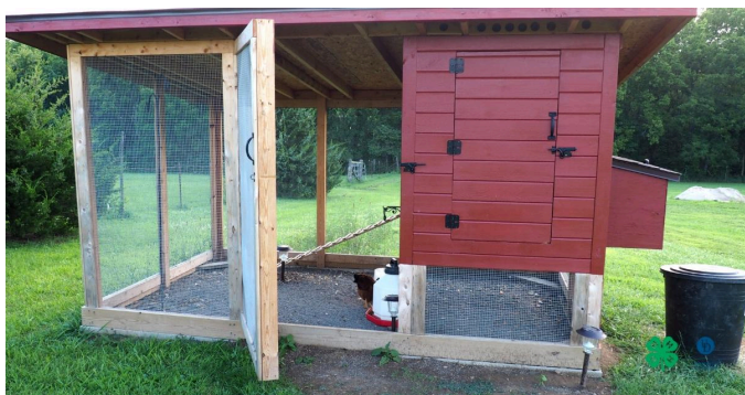
Example of a well ventilated chicken coop