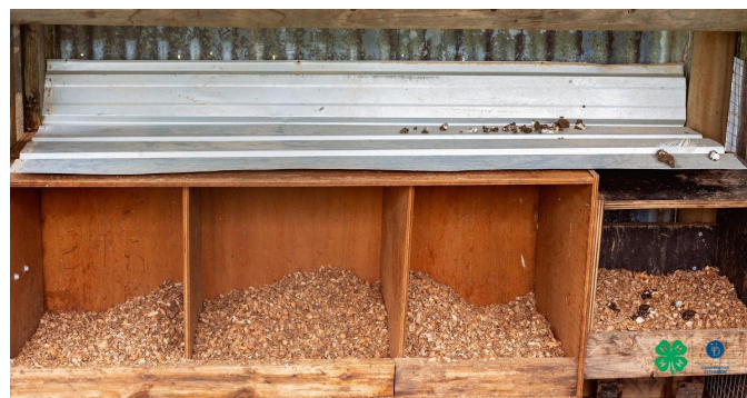
Nesting boxes (one box per 3-4 hens)