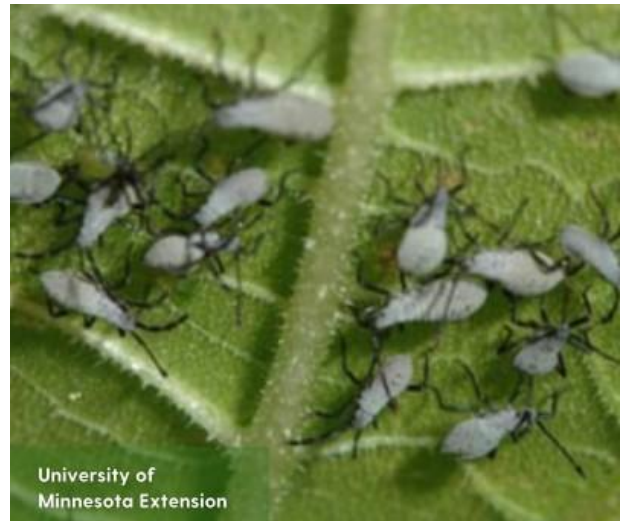
Squash bug nymphs.