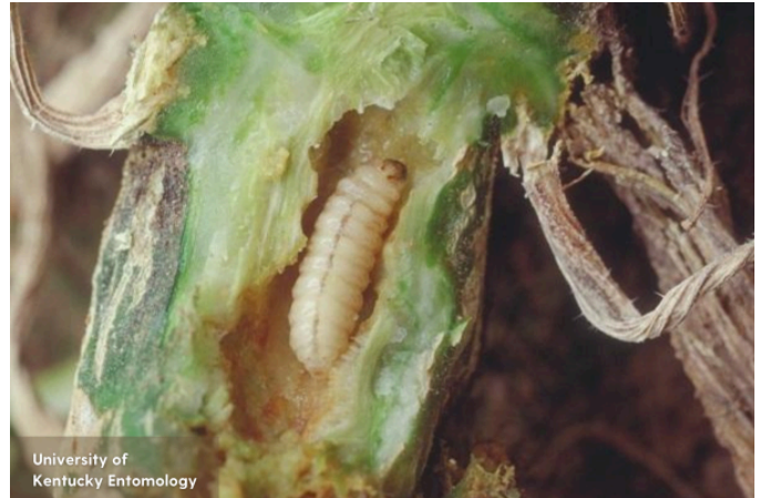
A squash vine borer larvae inside a hollowed-out stem.

This information is brought to you by the University of Delaware Cooperative Extension, a service of the UD College of Agriculture and Natural Resources — a land-grant institution. This institution is an equal opportunity provider.