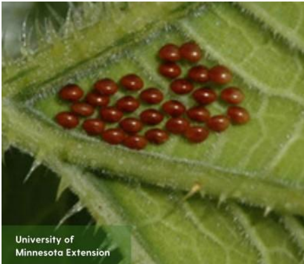
Squash bug eggs.