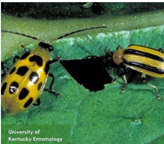
Spotted and striped cucumber beetles.

Adults feed on leaves, flowers, and fruits of cucumber, squash, and other cucurbits (spotted cucumber beetles also feed on other plant species). Both striped and spotted cucumber beetles can transmit bacterial wilt disease, which can cause sudden wilting and death of plants.