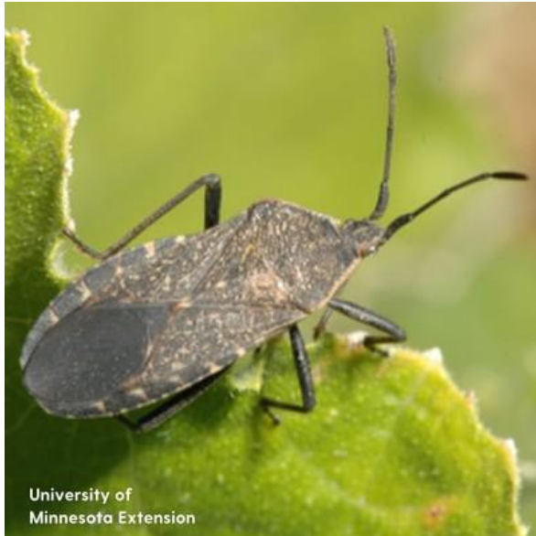
Squash bug adult.

Both nymphs and adults suck plant sap. It may cause small plants/seedlings to wilt and die; little damage occurs to older plants in midsummer and fall.