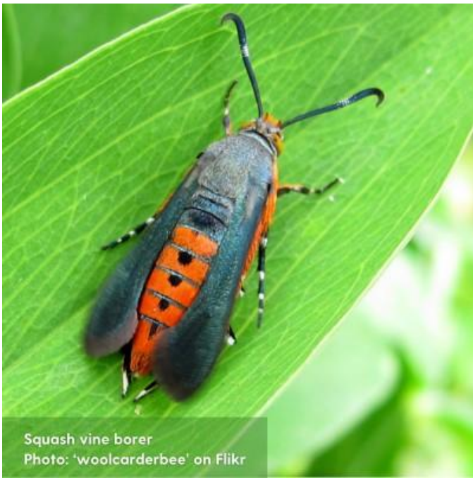
Squash vine borer

An adult squash vine borer.