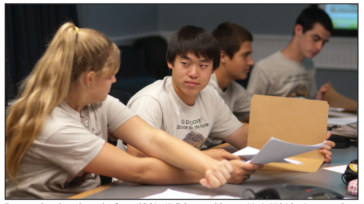
Empowered youth are the catalyst for establishing Well-Connected Communities in Mid-Atlantic states and beyond.

In the first year, UDCES's focus was ensuring that staff and the system were provided the opportunity to learn about coalitions throughout the state, and the work that was being done as part of them. Extension personnel were integrated into a state-based initiative known as Healthy Neighborhoods, supported through the Center for Medicare and Medicaid Innovation. Coalitions supported projects aimed at improving health in three communities: Wilmington, Dover/Smyrna and Seaford. Working with these community based coalitions, projects are underway to increase nutrition and wellness programming, develop teen leaders to teach younger children healthful decision making that prevents substance abuse, and create safer playgrounds and outdoor areas