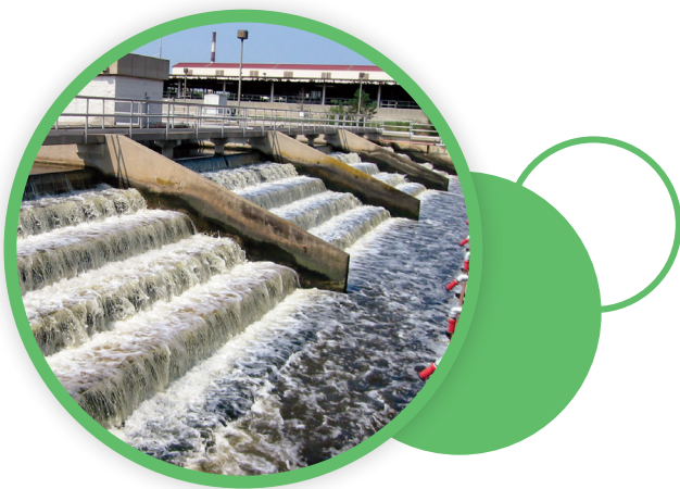
Effluent leaving a wastewater facility.

DESALINATED WATER: Saline water that has had its dissolved salts removed. – U.S. Geological Survey (USGS), 2016a