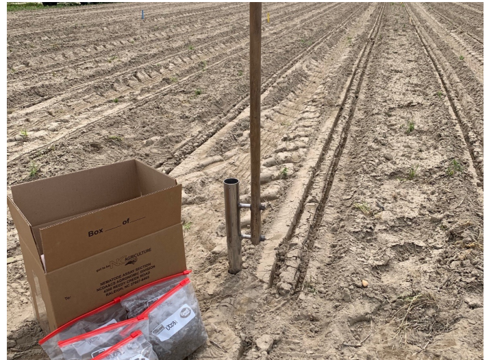
Figure 3: Soil probe and soil sample bags at the time of planting SCN field trials.