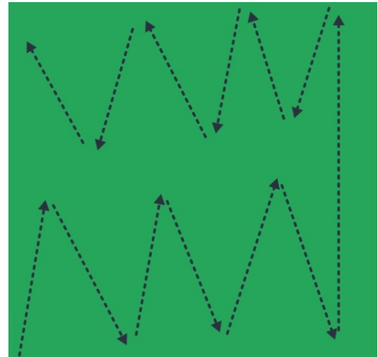
Figure 1: Sampling pattern for predictive samples