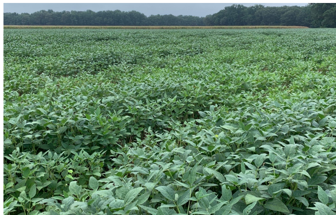
Figure 1: Field with areas of soybean stunting due to SCN.