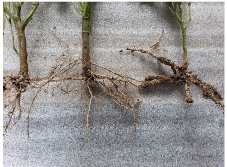
Figure 4: Soybean roots with various levels of galling from RKN.