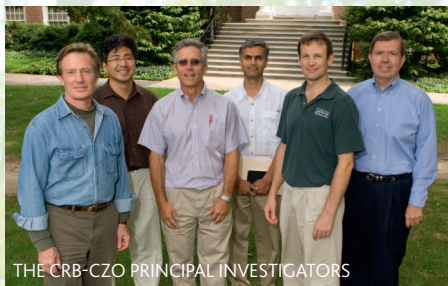
THE CRB-CZO PRINCIPAL INVESTIGATORS