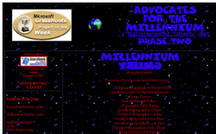
Figure 3. Graphic courtesy of Advocates for the Millennium.

This imaginative five-week project ( www.angelfire.com/mi/mllennium3/ , Figure 3) from Alberta, Canada, helps students in Grades 3–9 explore ideas related to millennia through work in language arts, social studies, and information and communication technology. Much of this project is telecollaborative; students engage in activities structured as global classrooms, keypal exchanges, telementoring, information exchanges, and electronic publishing. Telereasearch is used to help students explore millennium-related topics from multiple points of view; for example, students can make predictions, create inventions, or research important people from the past 1,000 years.