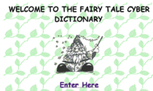
Figure 4. Graphic from the Fairy Tale Cyber Dictionary. Reprinted with permission.

In this simple yet powerful project for very young students ( www.op97.k12.il.us/instruct/ftcyber/index.html , Figure 4), each participating teacher chooses a familiar fairy tale to read aloud to his or her class. As a group, students then retell the story in their own words and with their own artwork, either writing or dictating their version of the tale. There's a clever challenge in this particular project's design: In retelling the fairy tale, students are asked to choose and include words beginning with each letter of the alphabet that communicate important aspects of the story.