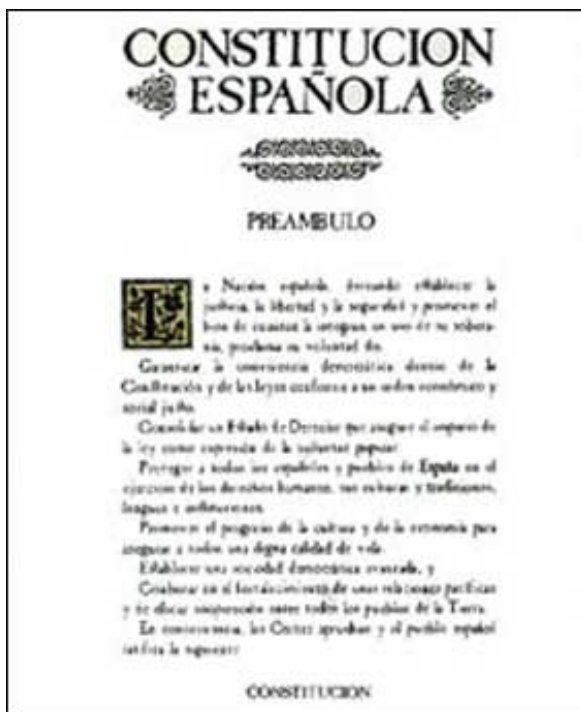
The Spanish Constitution of December 1978 laid the foundation for the development of a modern, democratic state.

This move came as a reaction to Franco's centralist policy, which had suppressed the recognition of the regions' ethnic and linguistic differences; the devolution of power came to symbolize the new democracy.