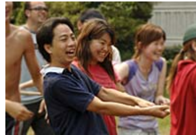
Students join forces in a tug-of-war at the ELI picnic.

11:09 a.m., Aug. 11, 2005--It was like a cookout at the United Nations. The English Language Institute (ELI) held its summer picnic, Friday, Aug. 5, hosting approximately 100 international students on the lawn of the institute.