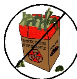
Do Not Overfill