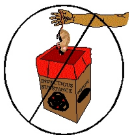
No Animal Carcasses