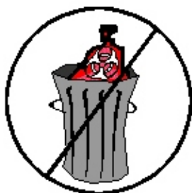
Do Not Dispose of in Normal Trash