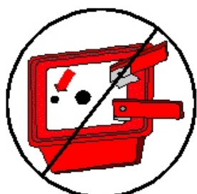
No Needle Clipping