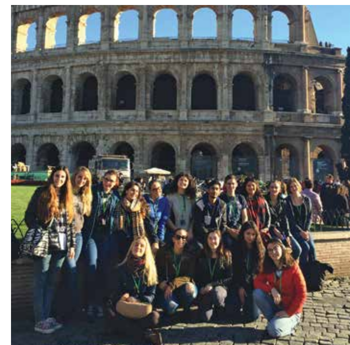
The Coliseum, Rome

In addition to the requirements for your major, you will be required to minor in a globally-focused field of study.