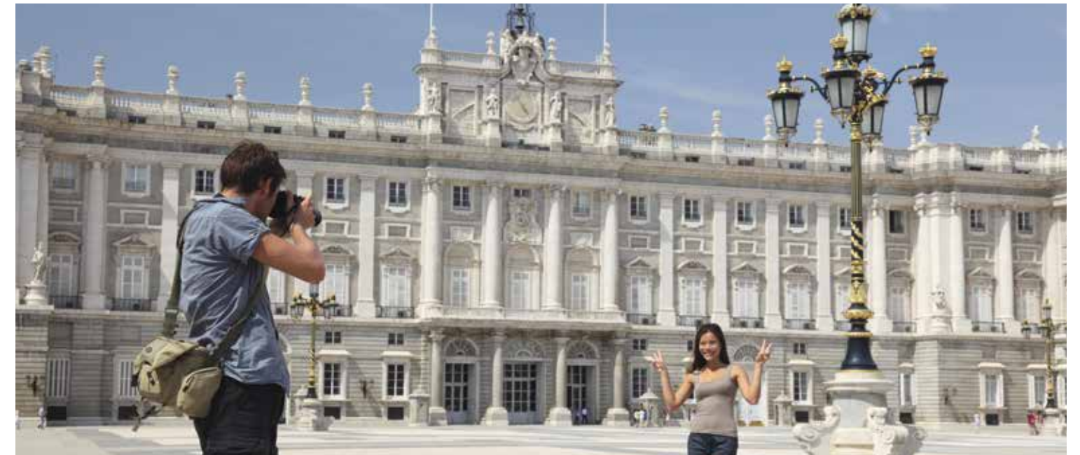
Royal Palace, Madrid

Your status as a UD World Scholar will entitle you to engagement with visiting foreign dignitaries and diplomats, and earns you a spot in UD's global community of international students and scholars. You will also receive guidance and mentorship in pursuing opportunities with the U.S. Fulbright Commission, Peace Corps, and multinational corporations, as well as international scholarships for postgraduate study or exploration.