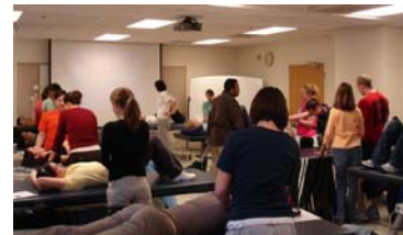
DPT II's practicing mobilizations and manipulations during PHYT808: Spine Management

As we have begun a new calendar year and our last year in the program there is much to look forward to. Please watch out for our continued education class in the Spring/Fall and other fundraising efforts for the Pitt-Marquette Challenge.