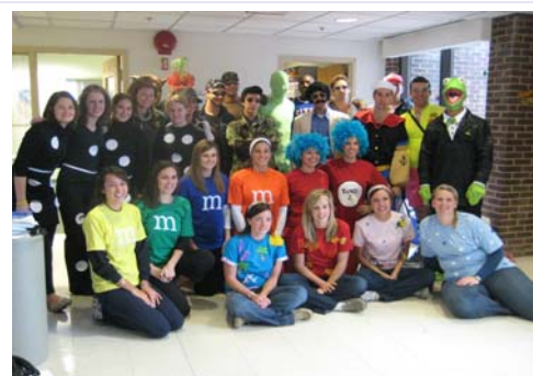
The DPT 1 class celebrates Halloween at the 2009 Halloween Luncheon

Currently, close to half of the 1 st years are in our first ICE, or integrated clinical experience. It's been rewarding to put our didactic knowledge to clinical use in the treatment of real patients. As our first year comes to a close we find ourselves very excited to welcome the UDPT class of 2012.