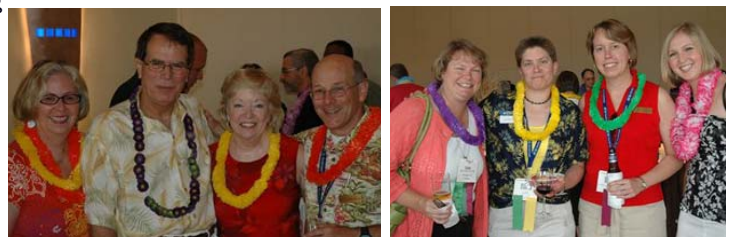
Friends and faculty members display their luau-themed clothes!