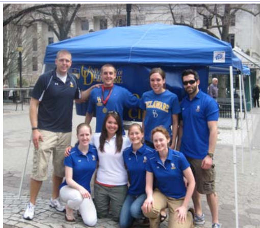
Caesar Rodney Half Marathon Massagers: