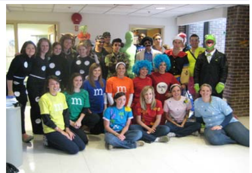
The DPT 1 class celebrates Halloween at the 2009 Halloween Luncheon

Currently, close to half of the 1 st years are in our first ICE, or integrated clinical experience. It's been rewarding to put our didactic knowledge to clinical use in the treatment of real patients. As our first year comes to a close we find ourselves very excited to welcome the UDPT class of 2012.