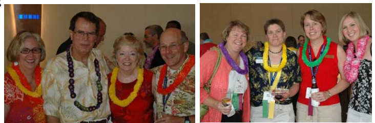
Friends and faculty members display their luau-themed clothes!