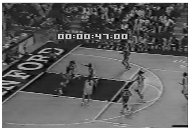
Figure 2. Video image from a single-camera sequence with poor quality. The right leg (partly hidden) of the player to the left, holding the ball, is injured. The video frame is captured at initial contact of the right foot.

of injury, we used the median instead of the mean because 1 analyst in several cases estimated the injury to occur much later than did the rest of the group. Results are reported as the means with SDs and ranges across cases. Finally, the SDs across analysts are reported as a measure of intertester reliability for each variable.