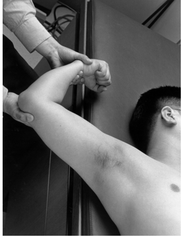
FIGURE 1. Biceps load test II. The arm to be examined is elevated to 120° and externally rotated to its maximal point, with the elbow in the 90° flexion and the forearm in the supinated position. The patient is asked to flex the elbow while resisting the elbow flexion by the examiner.

The reliability of the biceps load test II was evaluated by determining its accuracy and reproducibility. The test's accuracy was assessed by using the predictive value, sensitivity, and specificity. The reproduc-