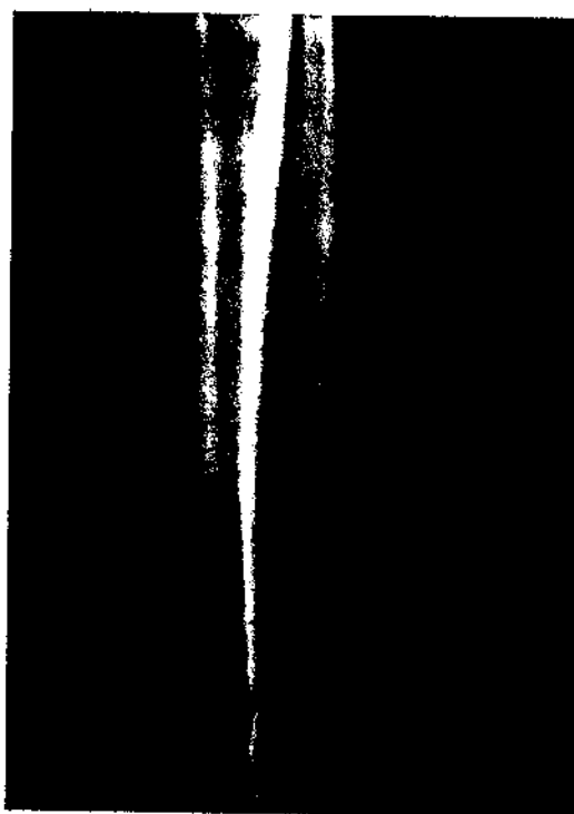
Figure 2 Case 1: follow up lateral radiograph of the tibia after 14 months showing that the fracture had healed.