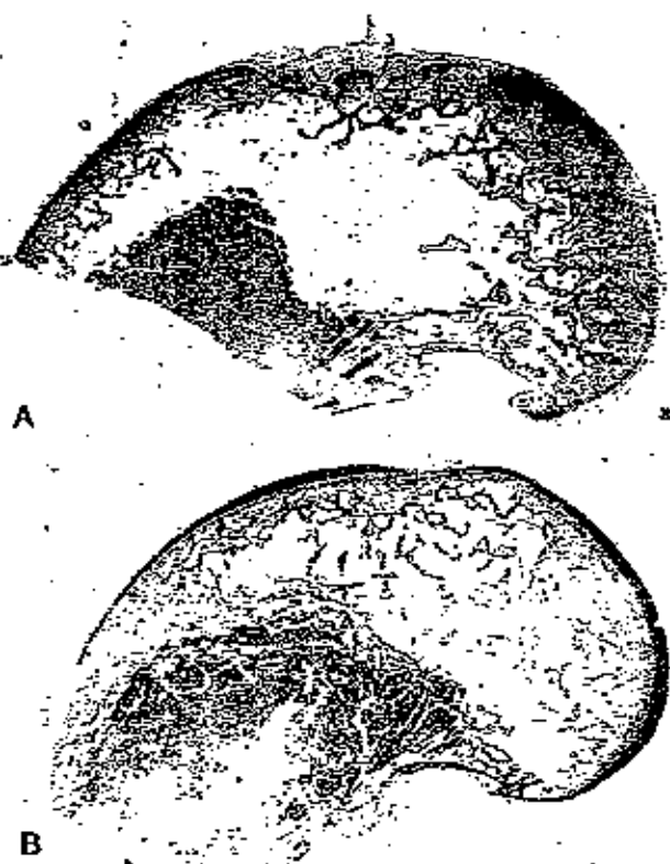
Fig 3A-B. Representative photomicrographs of safranin O stained histologic sections of (A) the nonsupplemented control articular cartilage from an unstable joint and (B) the contralateral normal joint from the same group.