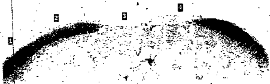
Fig 1. Photomicrograph documenting method of measurement. Site 1 graded as mild (Mankin score 1-3); site 2 graded as moderate (Mankin score 4-7); sites 3 and 4 graded as severe (Mankin score > 7). The extent of each lesion was taken by measuring the length in millimeters at each defined site and automatic calibration of the computer scans with a slide micrometer.

ables: number of lesions; grade of each lesion, and linear involvement of lesions. For these data two new variables were created, total linear involvement and total grade. These variables were calculated to sum all lesions in the same rabbit and to incorporate the number of lesions and the prospective variable. For example, the total grade was calculated by multiplying the mean grade and the number of lesions for every rabbit. For total grade and total linear involvement, group comparisons were made using Scheffe's multiple comparison test. 35 The proportion of animals in each group with one or more severe lesions was assessed using a chi squared test.