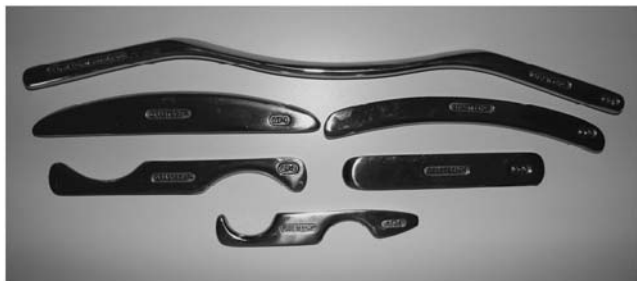
Fig 4. Stainless steel instruments used in GT.

symptomatic rowers, arm adduction of the involved side, coupled with head rotation toward the involved side, reproduced symptoms. 4 This described motion is descriptive of the follow-through motion of a volleyball player as they spike the ball. Follow-through motion brings the arm across the body while the head approximates the shoulder of the adducting arm. The volleyball player presented in this case was right-handed and experienced right-sided costochondritis.