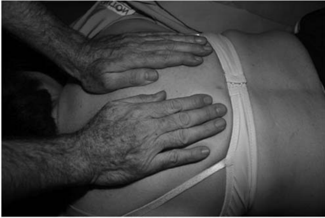
Fig 1. High-velocity, low-amplitude manipulation being applied to thoracic region.