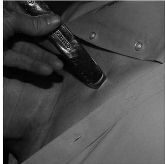
Fig 2. Application of GT to costocartilage.

be insidious. Her quality of play had been adversely affected because of the pain. The pain made it difficult for her to focus in the classroom and obtain restful sleep. When pain levels increased during play, it became difficult to “dig” and “spike” balls. She had no prior treatments for this problem.