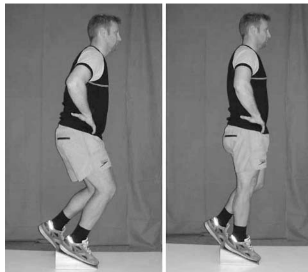
Figure 2 (A) Starting position for the concentric quadriceps training with the knee in 70° flexion on the 25° decline board. From this position, the knee was slowly straightened to full extension. (B) End position for concentric quadriceps training. (Photographs are reproduced with permission.)

The outcome of the treatment was evaluated using a visual analogue scale (VAS) for pain, where the patients themselves recorded the amount of pain during their sporting activity on a 100 mm long pain scale. The amount of pain was recorded