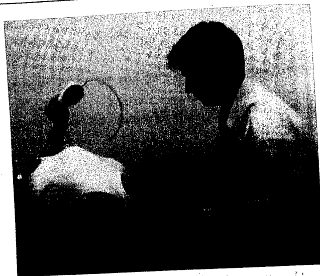
Figure 1. Training the cranio-cervical action with the use of feedback from the pressure biofeedback unit.

Interventions. The manipulative therapy (MT) intervention followed the regimen described by Maitland et al. 25 This regi-