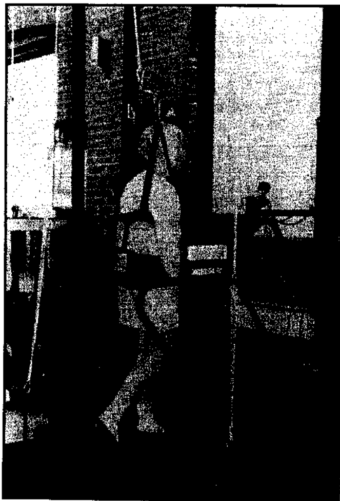
Figure 3. Patient performing harness-supported treadmill ambulation. The traction harness provides the unloading force.

Each patient's initial performance on the two-stage treadmill test showed limitations in the ability to ambulate on level surfaces without symptoms of low back or lower-extremity pain. These limitations were addressed by using harness-supported treadmill ambulation in which a vertical traction force can be applied to reduce the compressive loading on the spine and allow for