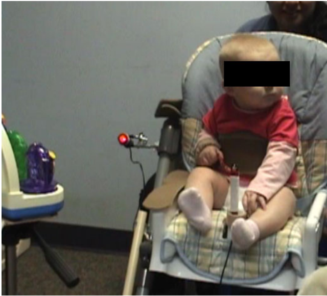
Figure 1 Experimental set-up for the social-object learning paradigm. It includes the infant, the musical toy on the infant's right side, and the caregiver on the infant's left side. The light activated by pulling the joystick during the baseline and extinction periods is also shown

caregiver were both located approximately 12 inches beyond the reach of the infant. A Sony mini DV camcorder placed in the front of the infant with an oblique view was used to record the infant's body movements and visual attention as well as some portion of the toy.