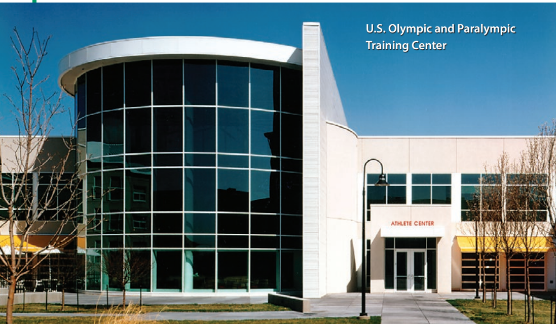
U.S. Olympic and Paralympic Training Center

To learn more about the USOPC visit: www.teamusa.org