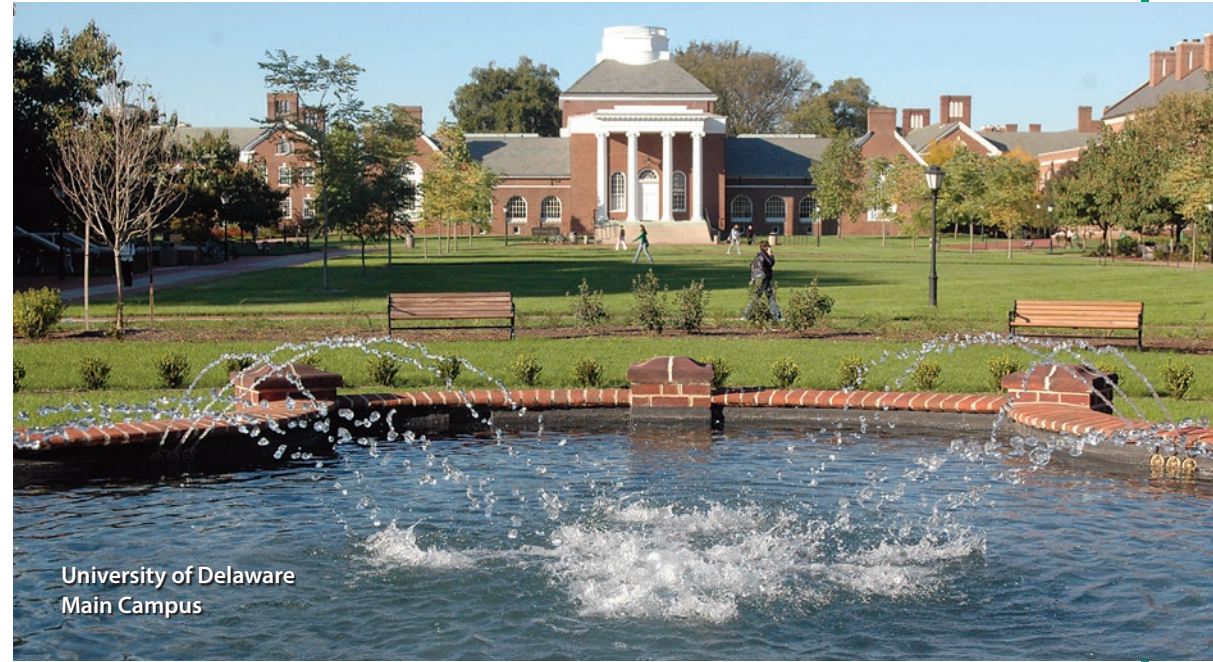
University of Delaware Main Campus

THE UNIVERSITY OF DELAWARE has grown from its founding as a small private academy in 1743 to a major university. The University offers an impressive collection of educational resources. The 16,000 undergraduate students may choose to major in any one or more of over 100 academic majors. The University's distinguished faculty includes internationally known scientists, authors, and teachers, who are committed to continuing the University of Delaware's tradition in providing one of the highest quality undergraduate educations available in the United States.