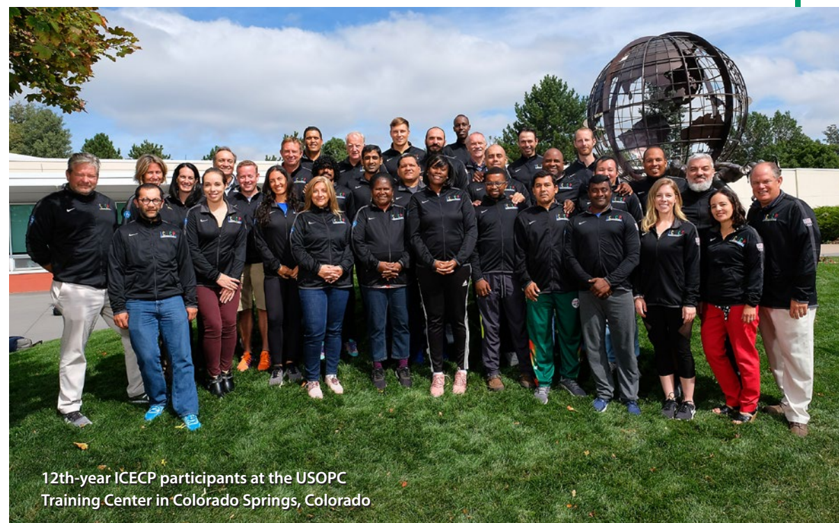
12th-year ICECP participants at the USOPC Training Center in Colorado Springs, Colorado