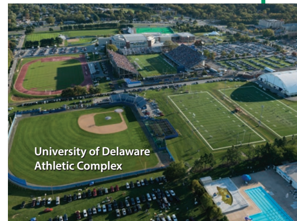
University of Delaware Athletic Complex

Visit www.udel.edu to learn more about the University.