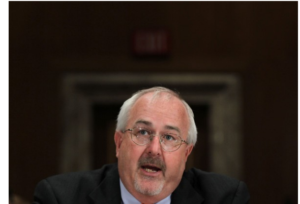
FEMA Head Craig Fugate testifies before U.S. Congress

Ready Indian Country initiative: to enhance tribal readiness @ ready.gov