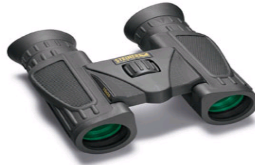
Steiner 10 x 26 Predator Pro