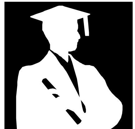
U.D. alumni, as well as students can use the Career Library in per-