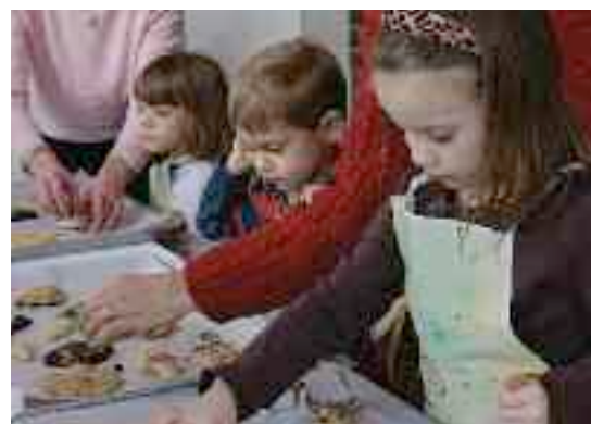
Children enjoy a hands-on experience at last year's Cookie Party.

Mark your calendar for the Annual Members Meeting on Thursday, February 21, beginning at 6:00 p.m. Complimentary hors d'oeuvres and refreshments will be served beginning at 5:30 p.m.